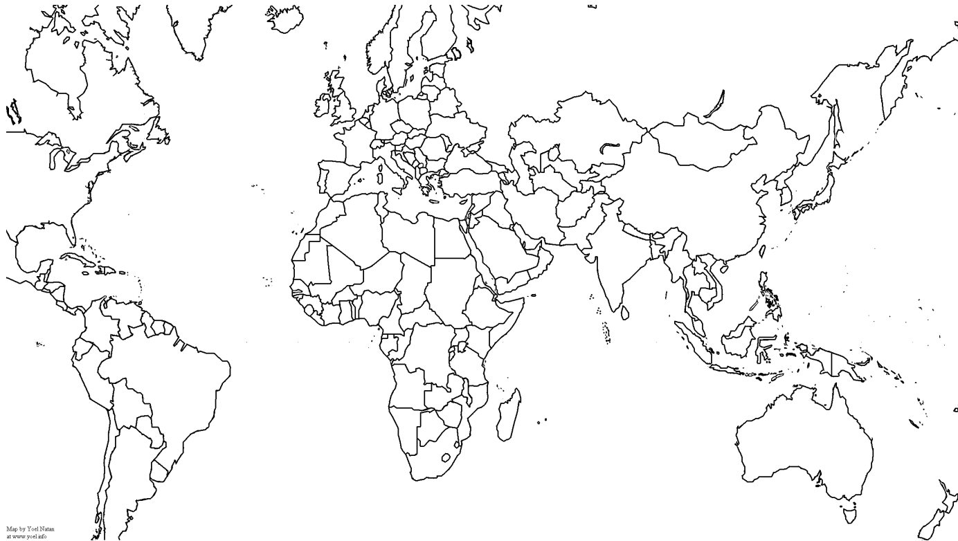
Map by Todd Mann at www.yool.info